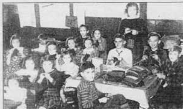
This photo from March 11, 1941, shows Stony Hill students knitting a large afghan that will be sent to the Red Cross in England during WW II.

We all walked to school and I was lucky to live close to the school, which no longer exists. Dunns built a house where the school used to be. In seventh grade I rode the bus to the big Bethlehem Central High School on Kenwood Ave., but that is another story.