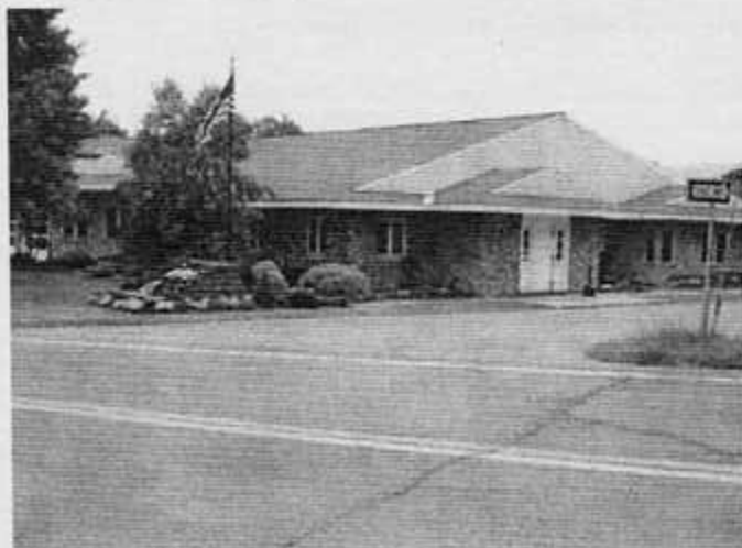
4 The Sentinel / Winter 2006