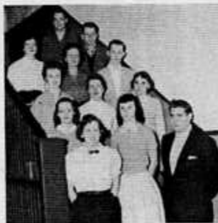
Traffic squad 1957.

Now that I am approaching my 50 th Voorheesville Class Reunion, I thought it would be fun to recall some of my high school memories.